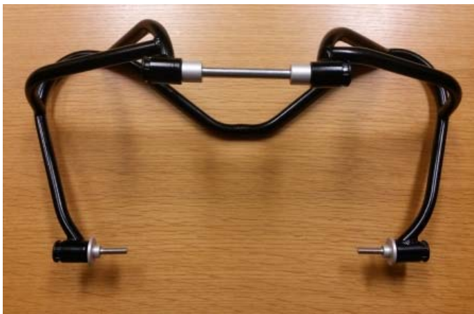
Parts in assembled state